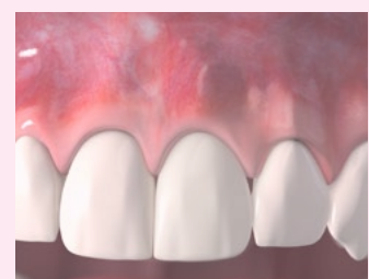
Final outcome of a restored gum with sufficient thickness (results may vary).