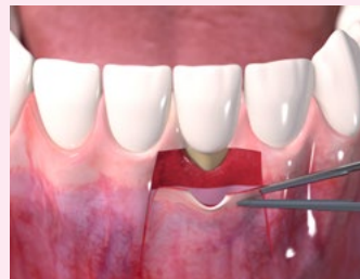
Preparation of the surgical site to uncover the affected area.