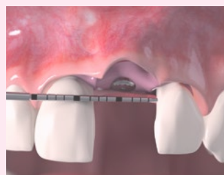
Preparation of the surgical site.