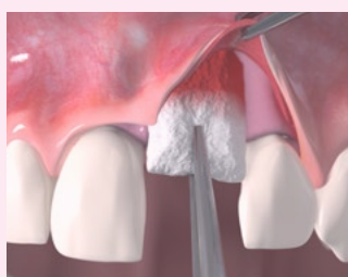
Insertion of the Geistlich matrix.