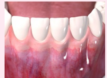
Final outcome of a completely covered tooth root (results may vary).