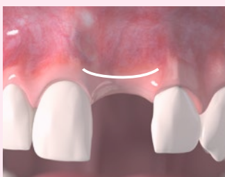
Initial situation showing a concavity due to missing gum tissue.