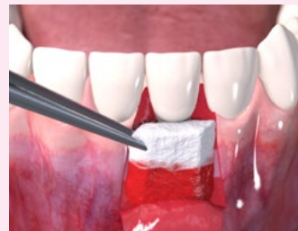
Insertion of the Geistlich matrix to cover the exposed tooth root.